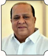
Shri. Hasanji Mushrif Hon. Minister, Medical Education Dept. Maharashtra State